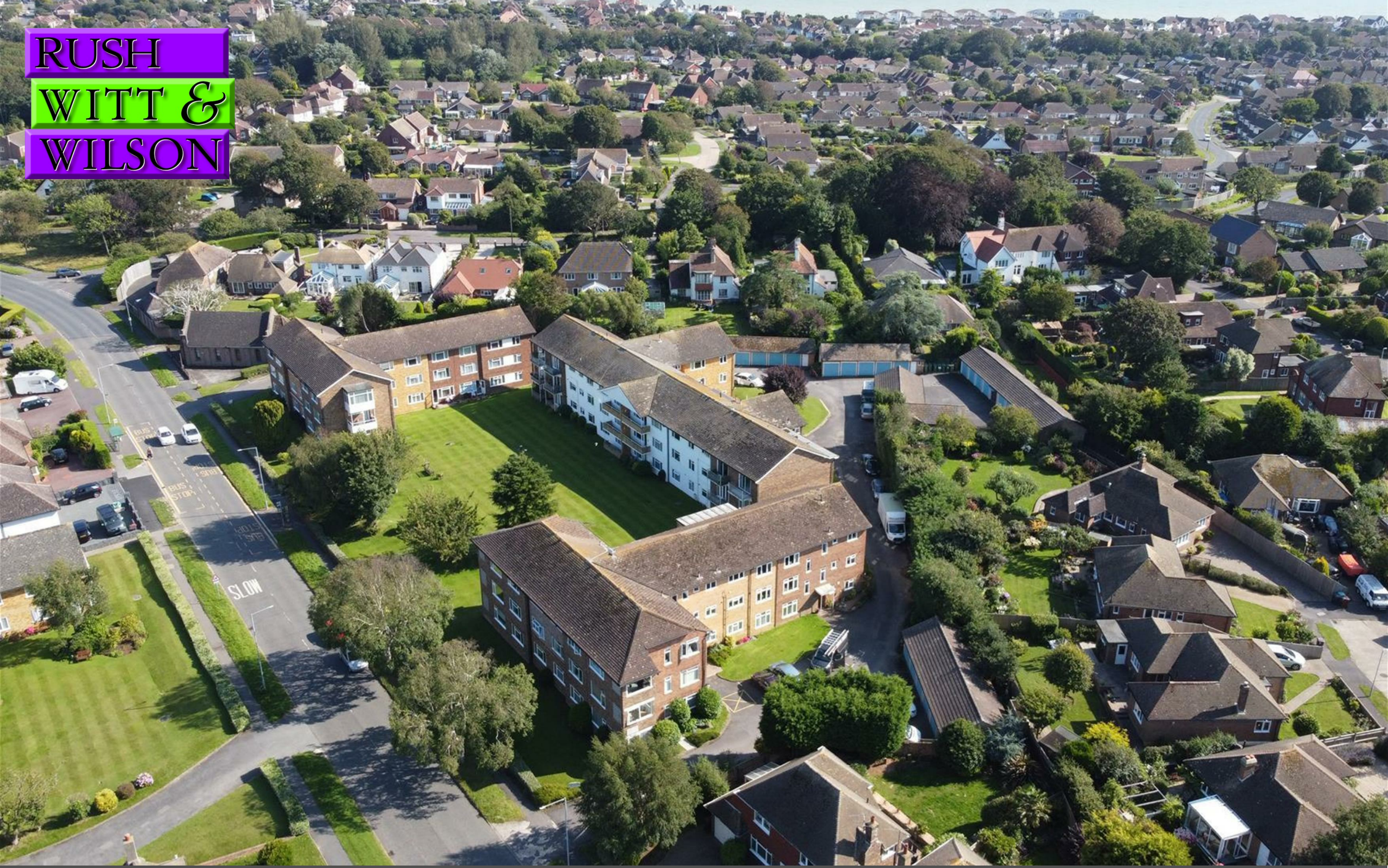
8 Howard House Birkdale, Bexhill-On-Sea, East Sussex TN39 3TU £265,000